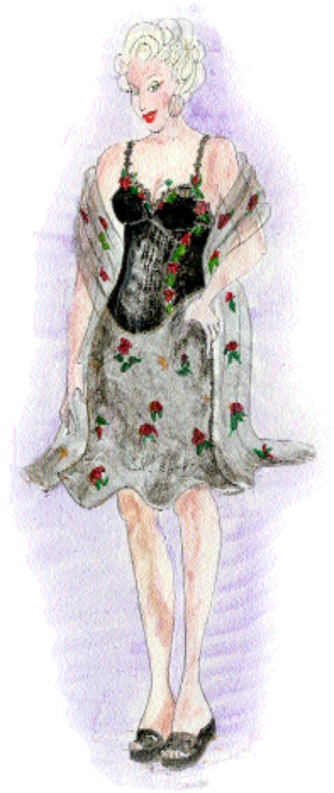
Kate Nelligan as 'Mrs. Jones' in "Boy Meets Girl"