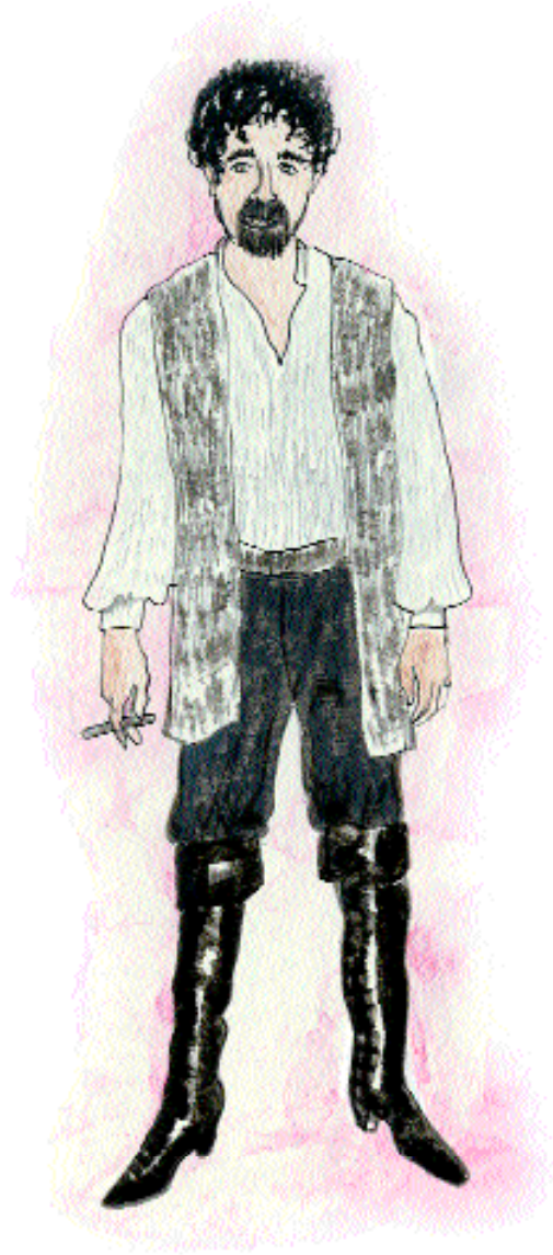
Joe Mantegna as 'Il Magnifico' in "Boy Meets Girl"