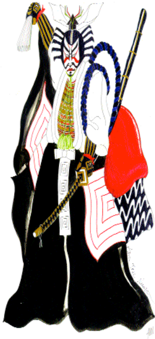
Kamakura No Gongoro Kagemasha in Shibaraku