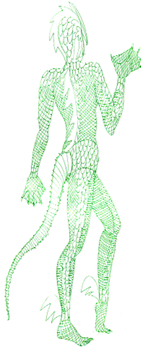
The Lizard in "Departure"